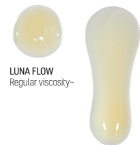
LUNA FLOW Regular viscosity-